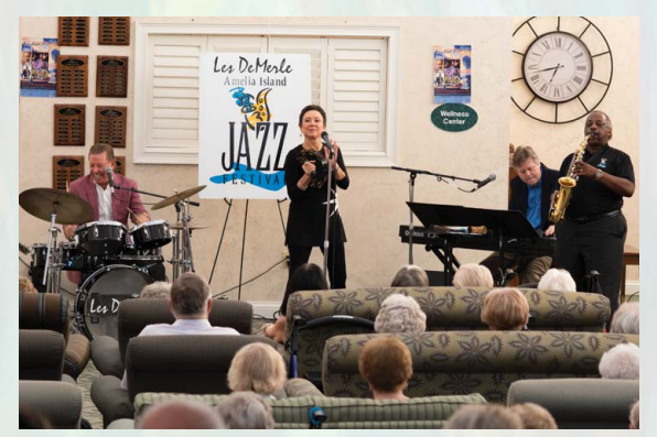
Jazz for Seniors

In 2024, the Amelia Island Jazz Festival partnered with the Nassau County Council on Aging to present two performances for the local senior community. These annual events offer engaging musical programs, providing cultural enrichment for seniors unable to attend other festival shows.